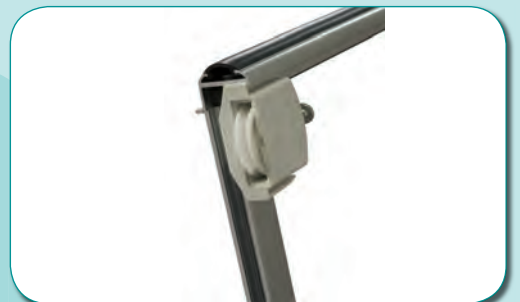
Acetal resin rollers for smooth operation

Contact your magic touch™ dealer for further information.