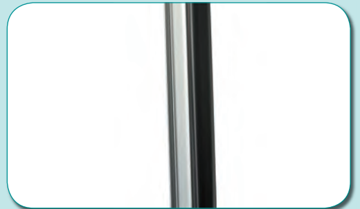
Rubber bumpers for quiet operation